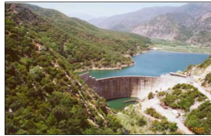
Matilija Dam and Reservoir